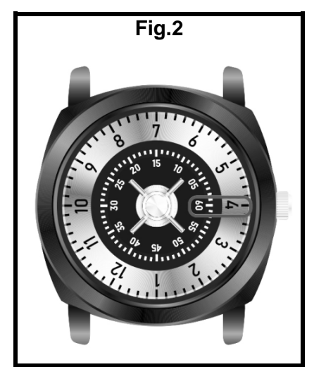
It is 4AM or 4PM.

Below are some examples for reading the time: