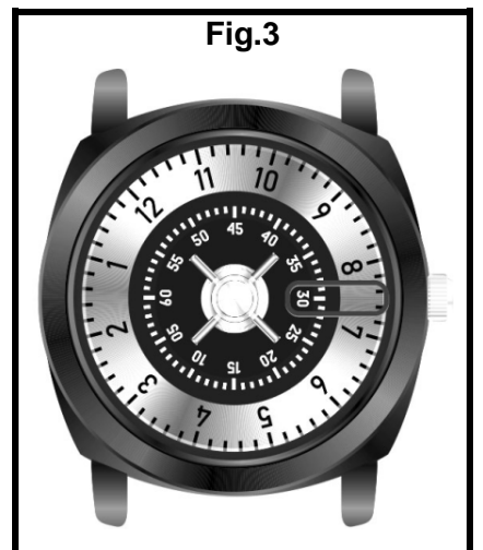
It is 7:30AM or 7:30PM.