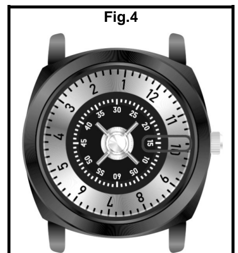
It is 10:15AM or 10:15PM.